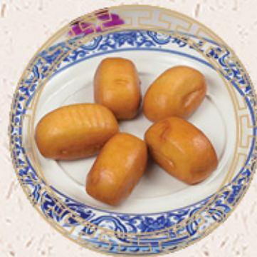
炸饅頭 (5 PCS) $4.95 Fried Bread