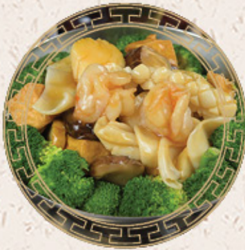
錦江豆腐煲 $24.95 Seafood with Fried Bean Curd in Casserole