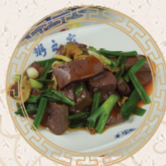
薑蔥鴨紅 $16.95 Sautéed Duck's Blood with Ginger & Scallion