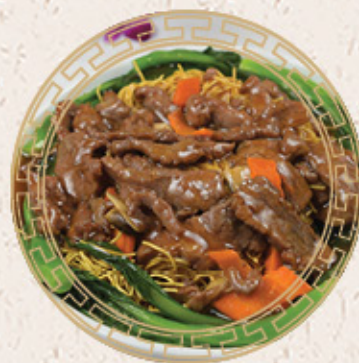
菜遠牛肉炒麵 $15.95 Beef Chow Mein with Chinese Vegetable