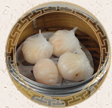
蝦餃 (4 PCS) $6.95 Steamed Shrimp Dumplings