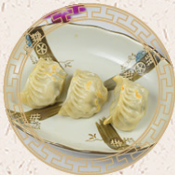
香煎鍋貼 (3 PCS) $3.95 Pan Fried Pork Dumpling