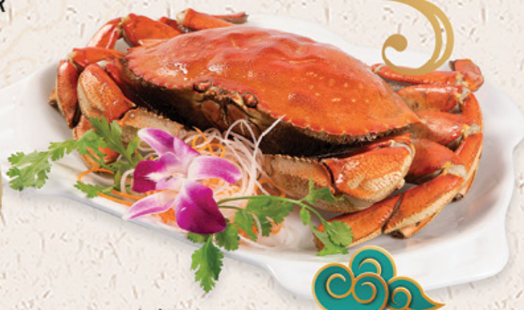
凍蟹 S.P. Cold Dungeness Crab in Chaos' Style