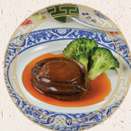
原隻紅燒鮑魚 S.P Braised Whole Abalone