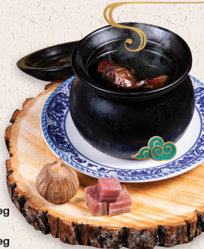
金蒜炖雞湯 $10.95/for 1 $98.95/for 10 Simmered Chicken Soup with Black Garlic