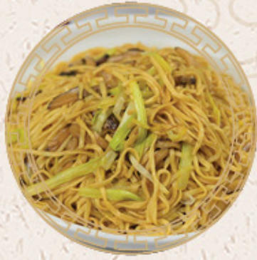
北菇乾燒伊麵 $15.95 E-fu Noodle with Shiitake Mushroom