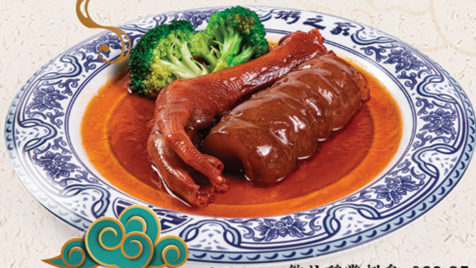
鮑汁鵝掌刺參 $20.95 Sea Cucumber & Goose Web with Abalone Sauce