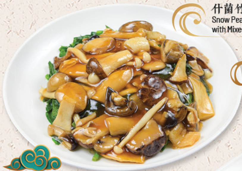
什菌竹筴扒豆苗 $26.95 Snow Pea's Leaf with Mixed Mushroom