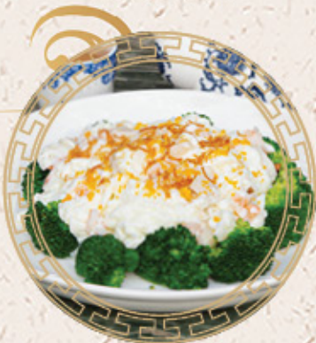
白雪尋梅 (蛋白牛奶炒蝦球帶子) $24.95

Scrambled Milky Egg White with Shrimp & Scallop