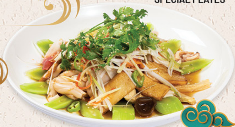
日式芥末撈三鮮 $33.95 Seafood Delight with Wasabi Sauce