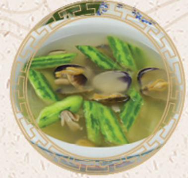
勝瓜花蜆湯 $20.95 Manila Clam & Squash Soup