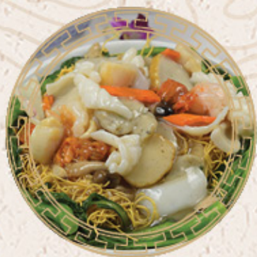
海鮮炒麵 $17.95 Seafood Chow Mein