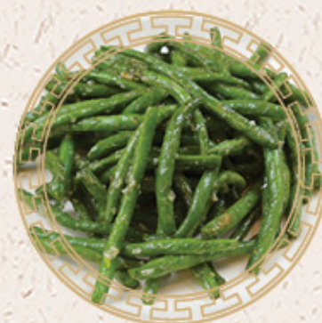
蒜蓉四季豆 $16.95 Sautéed String Bean with Garlic