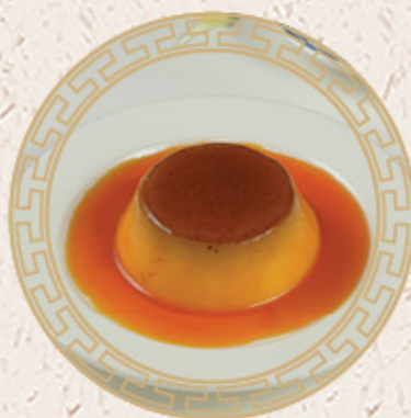
焦糖炖蛋 $3.95/each Creme Brulee