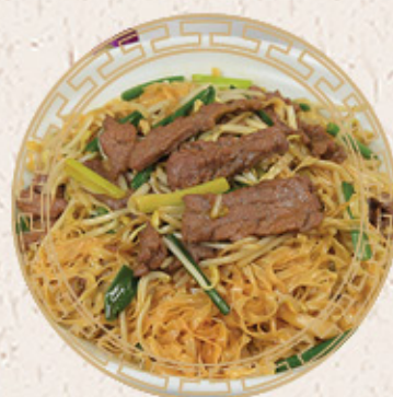
牛肉撈麵 $14.95 Beef Lo Mein