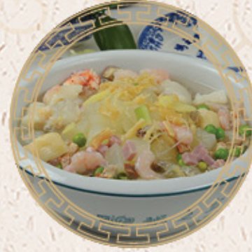
什錦冬瓜湯 $16.95 Winter Melon Soup with Chicken, Pork & Shrimp