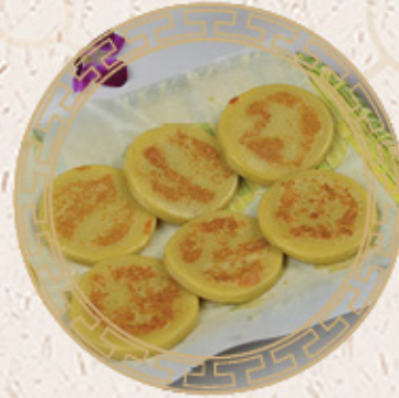
蕃薯餅 (6 PCS) $8.50 Sweet Potato Pan Cake