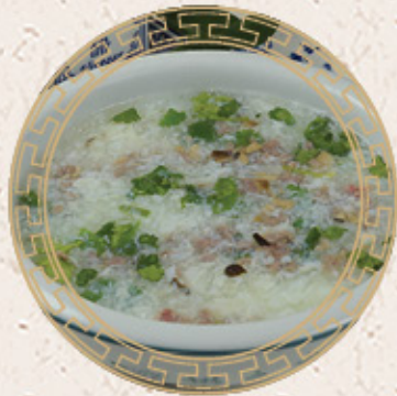
西湖牛肉羹 $18.95 West Lake Beef Soup