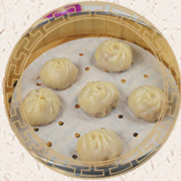
上海小籠包 (6 PCS) $6.50 Small Juicy Bun in Shanghai Style