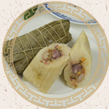
臺山花生鹹肉粽 $3.95 Chinese Sticky Rice Tamale with Peanuts & Salted Pork in Bamboo Leaf