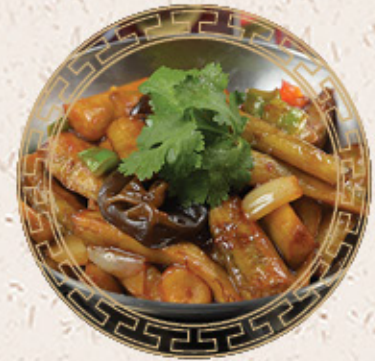
魚香茄子煲 $16.95 Eggplant with Spicy Garlic Sauce in Casserole