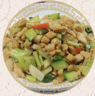
腰果雞丁 $19.95 Sautéed Chicken with Cashew Nuts