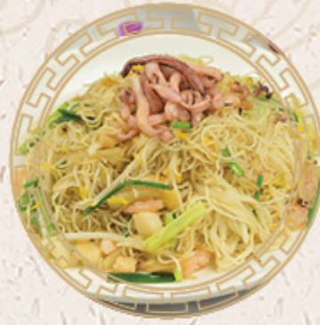
大鵬炒米粉 $16.95 Ta Peng Style Mei Fun with Squid