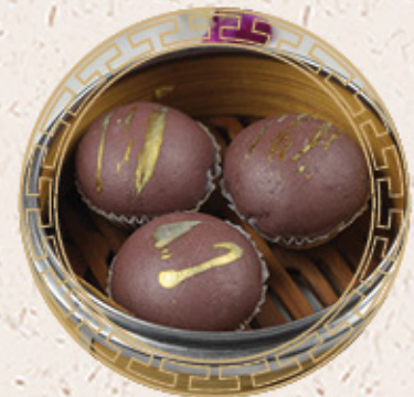
紫金流沙包 (3 PCS) $5.95 Steamed Egg Custard Buns