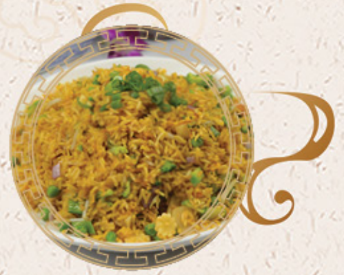
什菜炒飯 $14.95 Assorted Vegetable Fried Rice