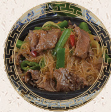
沙茶牛肉粉絲煲 $20.95 Sha Cha Beef & Vermicelli in Casserole