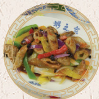
酸菜大腸 $16.95 Sautéed Pig's Intestine with Pickled Vegetable