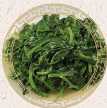
蒜蓉豆苗 $20.95 Sautéed Snow Pea's Leaf with Garlic