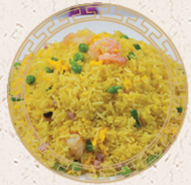
楊洲炒飯 $14.95 Young Chow Fried Rice with Pork & Shrimp