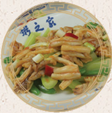
X.O. 蜜豆桂花蚌 $36.95

Sautéed Sea Clam & Sweet Pea Pod with X.O. Sauce