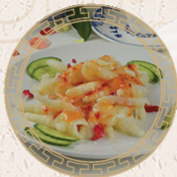
泰式鳳爪 $18.95 Cold Boneless Chicken Feet with Thai Sauce