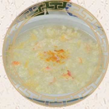
百花魚肚羹 $22.95 Fish Maw & Seafood Soup