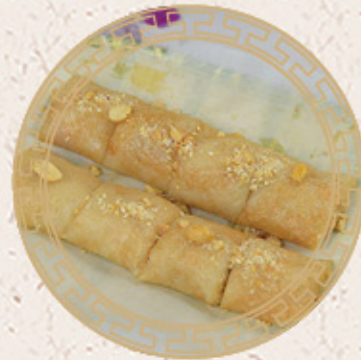
甜薄餐 $8.50 Cantonese Sweet Pancake