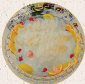
象拔蚌 S.P. Geoduck Clam Sashimi