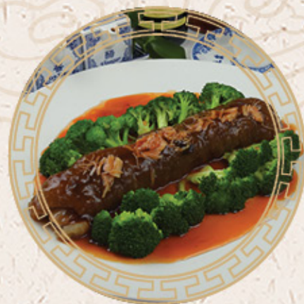
瑤柱扒原條黃玉參 $128 (10位用) Sea Cucumber with Dried Scallop (for 10)