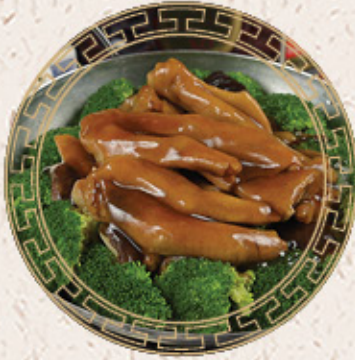
北菇鵝掌煲 $24.95 Goose Web & Mushroom in Casserole