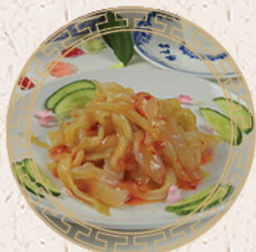
涼拌海蜇 $18.95 Cold Jelly Fish