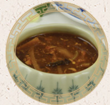
酸辣湯 $6.50/sm $13.95/reg Hot & Sour Soup