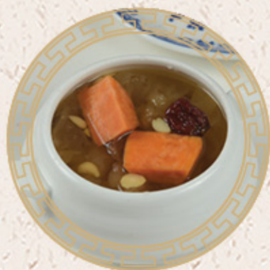
南北杏炖雪耳 $10.95/each Simmered Snow Fungus with Apricot Kernels