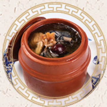
花旗參炖竹絲雞 $10.95/for 1 $98.95/for 10 Simmered Ginseng Chicken Soup with Pork & Conch