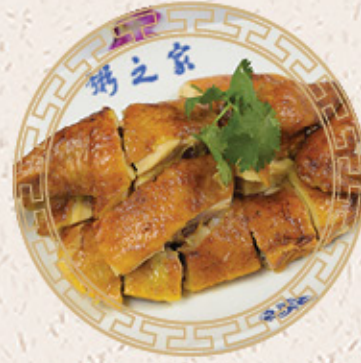
鹽焗雞 $16.95 / 半隻 $31.95 / 一隻 Baked Salted Chicken in Country Style (Half / Whole)