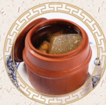
原盅干貝冬瓜湯 $10.95/for 1 $98.95/for 10 Simmered Dried Scallop Winter Melon Soup with Chicken & Pork