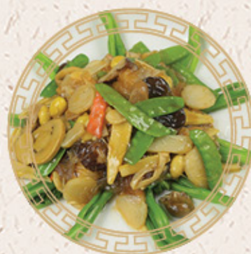
羅漢齋 $17.95 Assorted Vegetables & Vermicelli in Buddhist Style