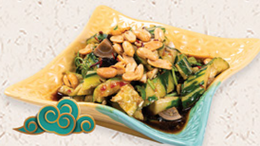
涼拌皮蛋黃瓜 $14.95 Cold Pickles with Preserved Egg