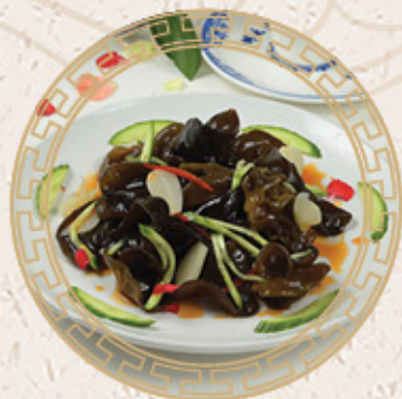
香醋拌木耳 $13.95 Black Fungus with Aged Vinegar