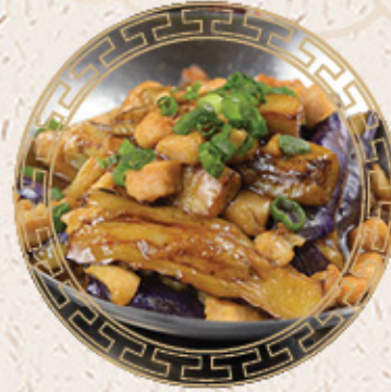
鹹魚雞粒茄子煲 $19.95 Salted Fish, Chicken & Eggplant in Casserole