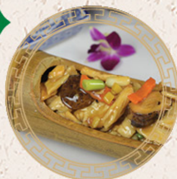
北菇滑雞燉飯 $10.95 Rice Baked with Chicken & Mushroom