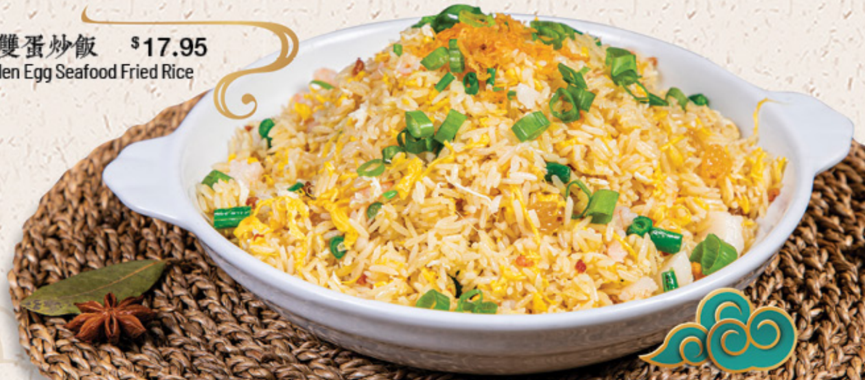
金雙蛋炒飯 $17.95 Golden Egg Seafood Fried Rice