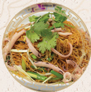
豉油皇吊片炒麵 $16.95 Soy Sauce Chow Mein with Squid