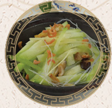
節瓜蝦米粉絲煲 $15.95 Dried Shrimp, Zucchini & Vermicelli in Casserole