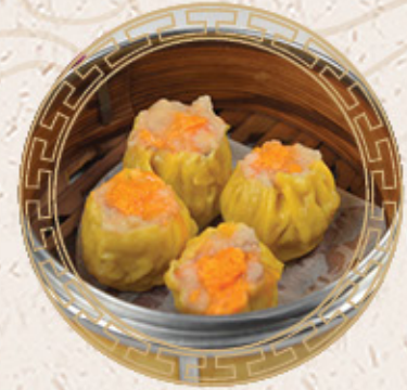
燒賣 (4 PCS) $5.95 Steamed Pork Shui Mai