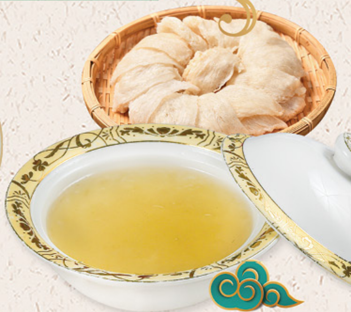
冰花炖官燕 $56.95/each Simmered Natural Bird's Nest with Rock Candy