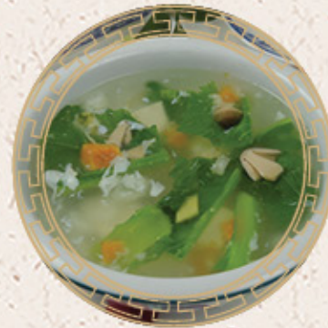
咸蛋芥菜肉片湯 $16.95 Preserved Egg, Mustard Green & Pork Soup