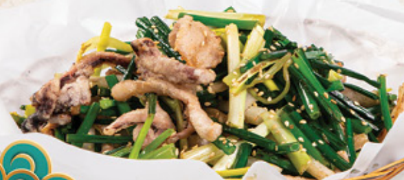
粥之家小炒王 $24.95 Sautéed Dried Shrimp & Squid with Chive