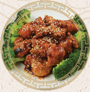
芝麻雞 $19.95 Sesame Chicken