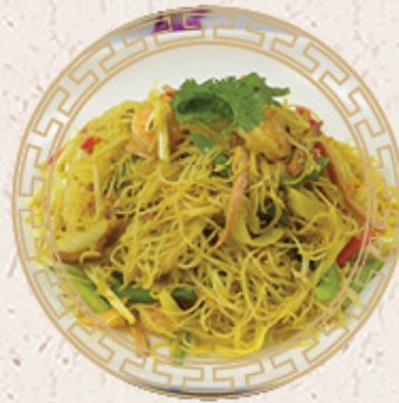
星洲炒米粉 $14.95 Singapore Style Mei Fun