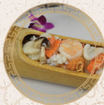
海鮮燉飯 $12.95 Rice Baked with Seafood