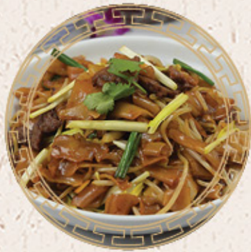
干炒牛河 $15.95 Beef Chow Fun Noodle