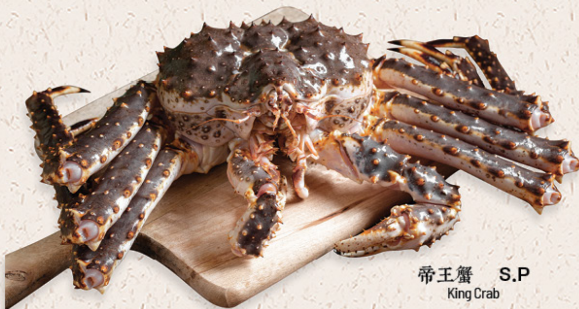
帝王蟹 S.P. King Crab

Bakes Chilean Sea Bass with Garlic & Bean Sauce