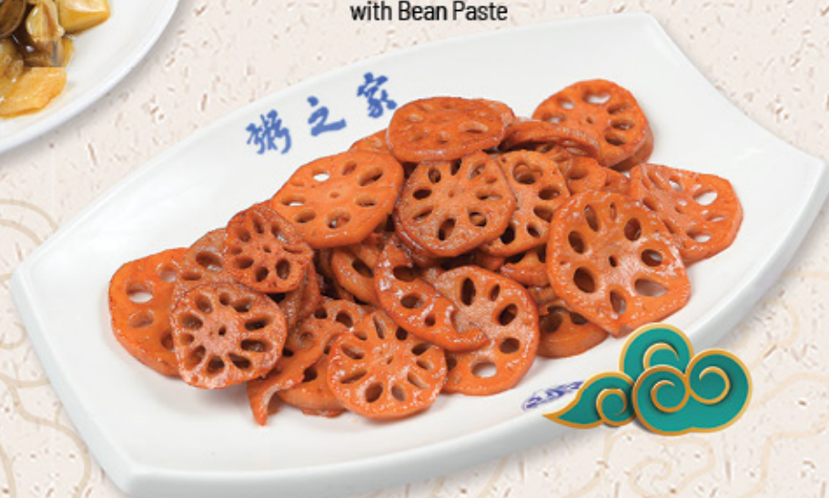
南乳炒藕片 $16.95 Sautéed Lotus Root with Bean Paste