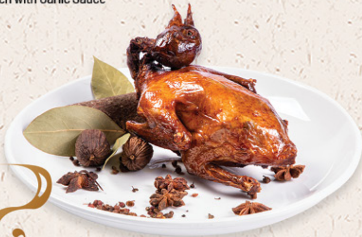
紅燒乳鴿 $23.95 Crispy Fried Young Pigeon