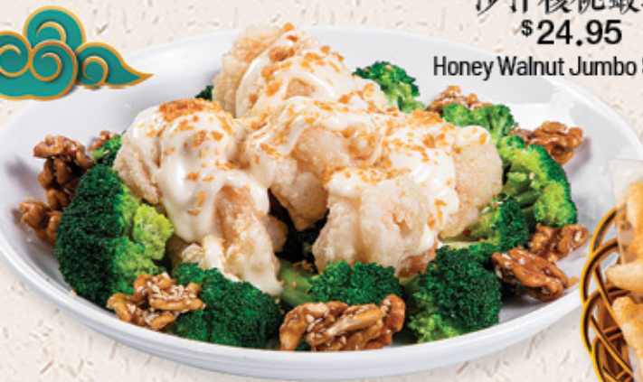
沙汁核桃蝦球 $24.95 Honey Walnut Jumbo Shrimp