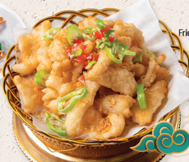
椒鹽鮮魷 $16.95 Fried Squid with Salt & Pepper